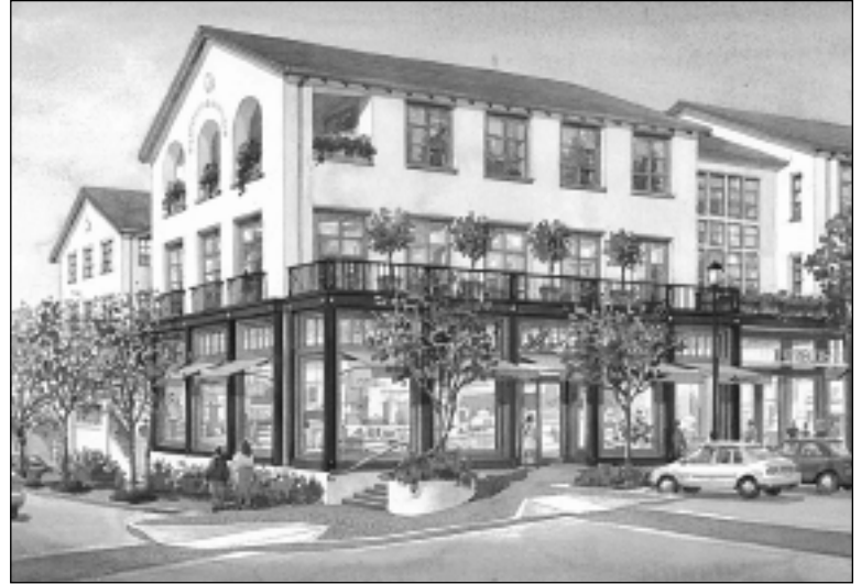
Artist rendering of Lafayette Mercantile from the corner of Mt. Diablo Blvd. and Lafayette Circle.

Lafayette Mercantile will add life and color to the downtown retail pedestrian corridor and the City is eager to see this long vacant parcel redeveloped by a project of this caliber.