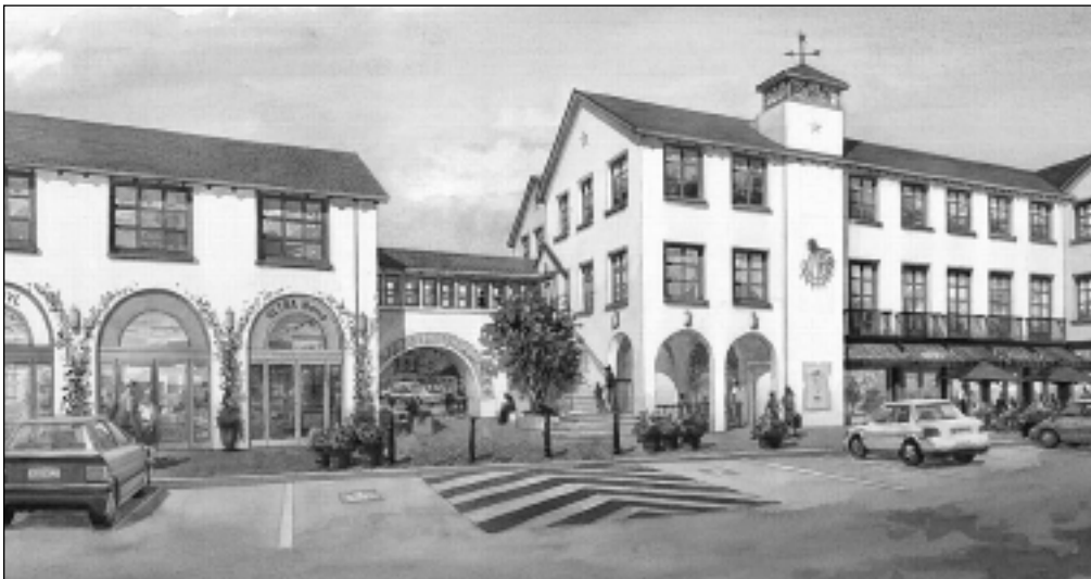
Artist rendering of Lafayette Mercantile from retail parking.