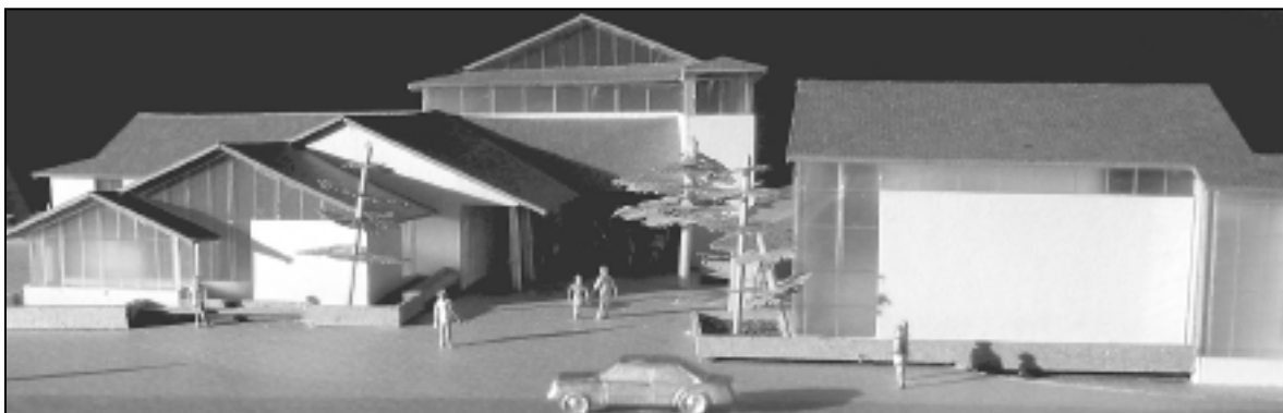
Looking South from Mt. Diablo Blvd.