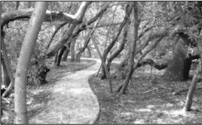
This neighborhood trail in the Hidden Oaks development will open soon.

Lafayette has an existing network of over 16 miles of community trails. In addition, Lafayette has many unique aspects that enable the development of an exceptional trail system, including convenient access to three large regional facilities: Lafayette Reservoir, Briones Regional Park and Las Trampas Regional Wilderness. Together, these trails distinguish our fair City and provide a wide array of opportunities for hiking, biking, and horseback riding.