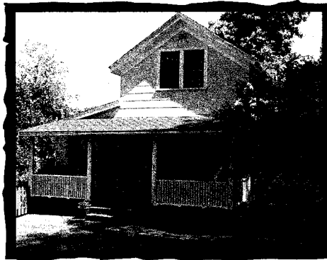
In 1876, this house on Martino Road was built as a working farmhouse on 100 acres.