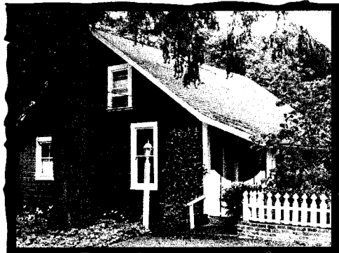
The Daley House on Moraga Blvd. was originally built as a barn in 1850.

At 3306 Moraga Blvd. is the historic Daley House, which is often cited as the oldest home in Lafayette. According to County records, the Daley structure was originally built as a barn in 1850 and converted to a house in approximately 1860. However, there is evidence that the original structure burned down and was rebuilt in 1914.