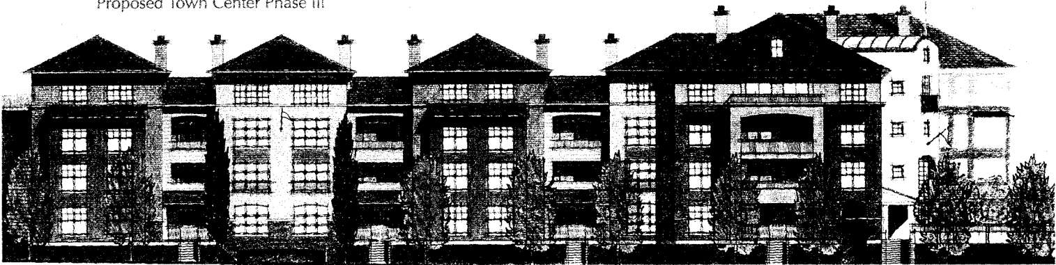
Proposed Town Center Phase III

Public hearings to review this project will begin later this summer.