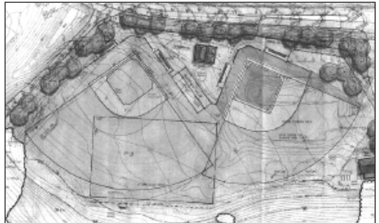
Proposed Ballfield Plan for 711 St. Mary's Rd.

The 711 Saint Mary's Road Park has been a nucleus of recreational activity since the 1950's. Lafayette Little League was the primary developer — building and maintaining the baseball fields. In the early days, the property was owned by a non-profit organization called Lafayette Community Center Inc. They worked with the City to create a Master Plan that envisioned a youth center, a multi-purpose meeting room, off-street parking, play and picnic areas, and a community swimming pool and bathhouses. Unfortunately, due to budget constraints, that plan was never