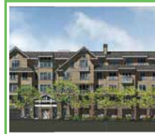
Town Center III 69 Condos | 7 BMR Approved 2012 Completed 2018 13