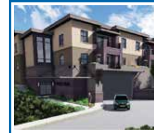
Valley View 42 Apartments Approved 2019 Approval Expired 2024 17