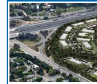
Terraces of Lafayette 315 Apartments | 47 BMR Approved 2020 Not Yet Constructed 18