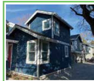
942 Dewing Ave 5 Condos Approved 2015 Completed 2020 5