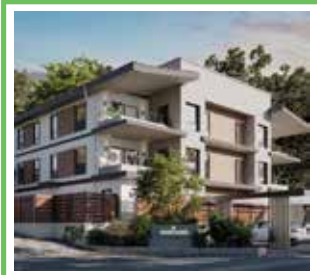
The Woodhaven 6 Condos Approved 2017 Completed 2025 10