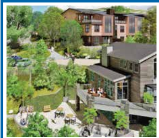
Woodbury Highlands 99 Condos | 15 BMR Approved 2017 Under Construction 11