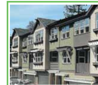
Marquis Townhomes 23 Townhomes Approved 2011 Completed 2014 1