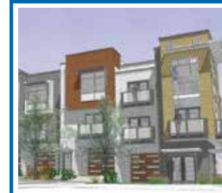
Samantha Townhomes 12 Townhomes Approved 2023 Not Yet Constructed 16