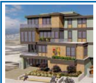
West End 12 Condos | 2 BMR Approved 2020 Approval Expired 2024 8