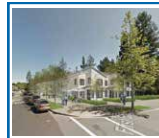
Madison Park 71 Apartments | 8 BMR Approved 2021 Not Yet Constructed 3