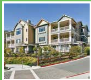
The Woodbury 56 Condos | 18 BMR Approved 2007 Completed 2016 9