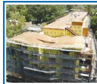
Blue Oak 23 Condos | 4 BMR Approved 2021 Under Construction 4