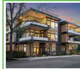
210 Lafayette Circle 13 Condos | 2 BMR Approved 2018 Completed 2022 14