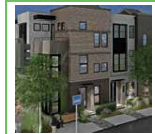
The Mill at Brown 13 Condos | 2 BMR Approved 2019 Completed 2022 15