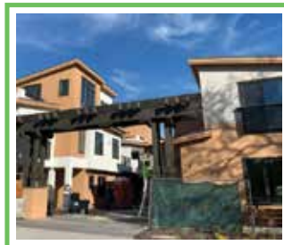
'SIX' by Lenox 6 Condos Approved 2016 Completed 2020 7