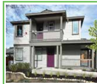
Chestnut Townhomes 5 Townhomes Approved 2018 Completed 2020 6