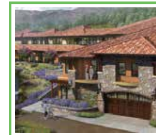
Lafayette Park Terrace 18 Condos | 3 BMR Approved 2008 Completed 2019 2